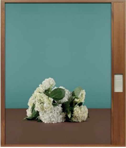
Taryn Simon, 'Memorandum of Understanding Between the Royal Government of Cambodia and the Geovernment of Australia Relating to the Settlement of Refugees in Cambodia, Ministry of Interior, Phnom Penh, Cambodia, September 26, 2014', from the Series 'Paperwork and the Will of Capital'. 2015

In 2015, when the British artist Taryn Simon became interested in signings of political agreements or treaties, where 'powerful men flank floral centerpieces curated to convey the importance of the signatories and the institutions they represent', she decided to botanically analyse, recreate and photograph these flower arrangements. While enjoying her work, our own interest in political agreements goes in another direction: We are inquiring whether artists could support political mediators in the very processes of negotiation that would lead to such accords. In this, we just received a mandate from the Swiss Ministry of Foreign Affairs to organise a series of seven webinar discussions between artists and mediators who want to explore the possibilities of such collaborations. While the first exchange compared the ways, in which two guests – a poet and a diplomat – use language, the upcoming webinar will focus on the issue of creating trust.